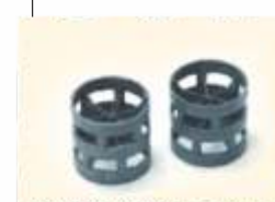
PALL RING MEDIA