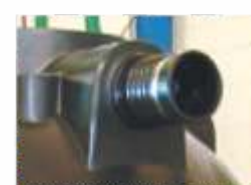
FLEXIBLE - IN & OUTLET